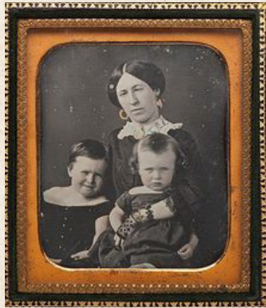
Julia, Frederick and Ulysses, Jr. (1854)

the 4th Infantry was assigned to the Pacific Coast in 1852. Grant departed on July 5th, and his second son Ulysses S. Grant, Jr. was born on July 22nd. The separation (July 1852 to Summer 1854 when he resigned from the Army) was emotionally very difficult for then Brevet Captain Grant, but I would like to believe the physical presence of his simple gold band engraved with Julia's name gave him some measure of comfort.