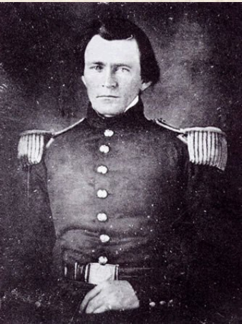
Brevet Second Lieutenant Grant c. 1844 with his ring