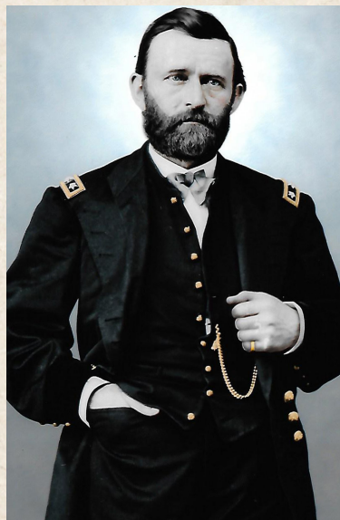
U.S. Commanding General Grant with his ring

Upon his return, their life together resumed – Grant took up farming, two more children were born to the couple and their family life flourished. Illness and the impact of the Panic of 1857 (the first worldwide economic crisis from which the U.S. economy did not fully recover until the onset