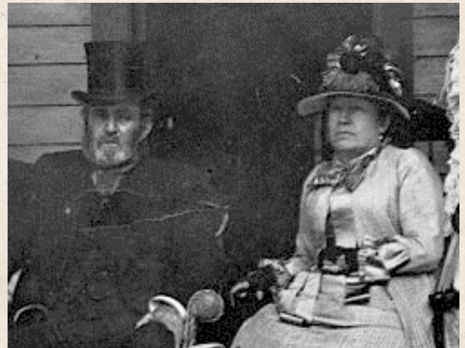
Photo of Grant and Julia at the Cottage in 1885 documents signs of his weight loss (note wrists)

cover of the August 8, 1885 edition of Frank Leslie's Illustrated Newspaper – and later laid to rest with the General in his granite sarcophagus within his tomb at Riverside Park in Manhattan. To date, I have not been able to confirm Grant's West Point ring's current location.