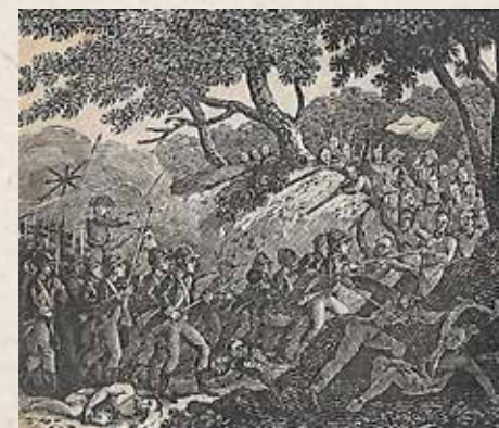
Engraving of French & Indian War battle scene