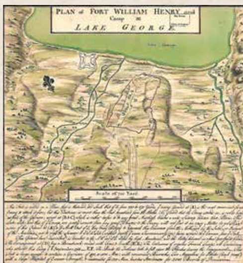
Fort William Henry view