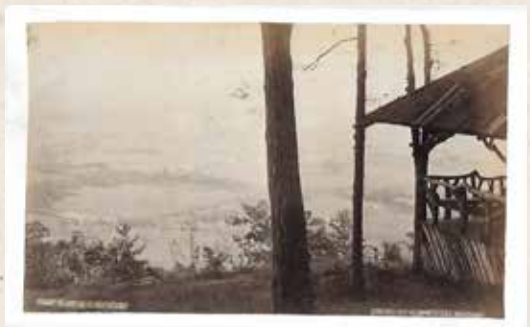
View from Eastern Overlook