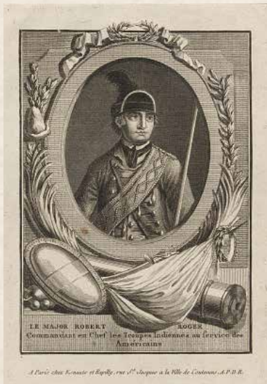
1780 Robert Rogers engraving