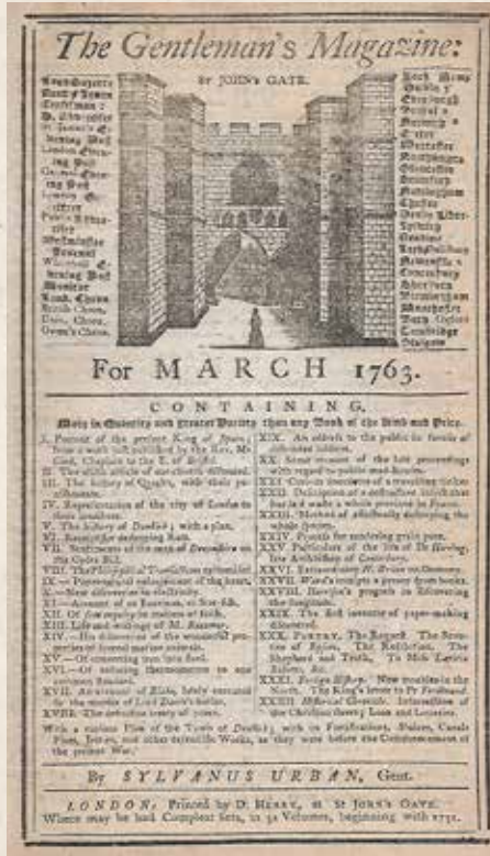
March 1763 newspaper containing the February 10 treaty terms ending the French & Indian War