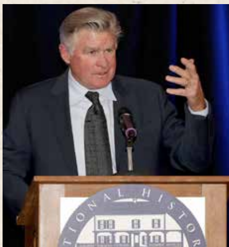
Actor Treat Williams