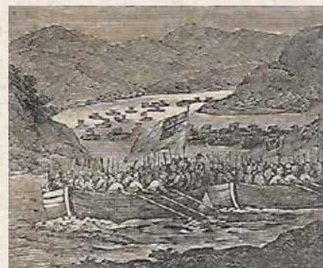
British forces on Lake George